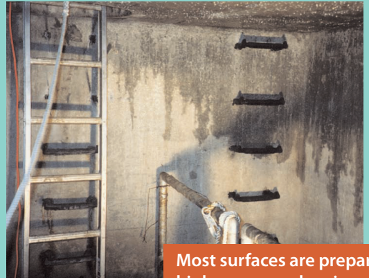
Most surfaces are prepared by high-pressure cleaning

The corrosive and abrasive environment of municipal pump stations present a formidable challenge to aging wastewater infrastructures.