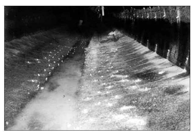
Gel encapsulation injection.