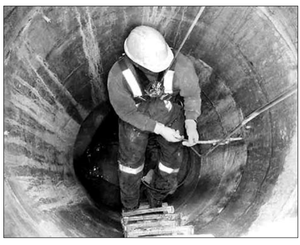
Manhole joint injection.

Water Quality Association has tested Azo-Grout 675 in accordance with the National Sanitation Federation (NSF) standard 61 and has approved this material for contact with potable water.